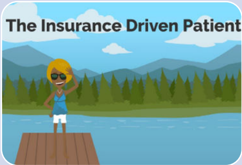
The Insurance Driven Patient