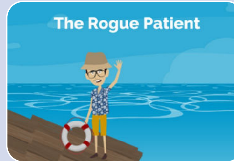
The Rogue Patient