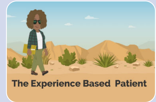
The Experience Based Patient